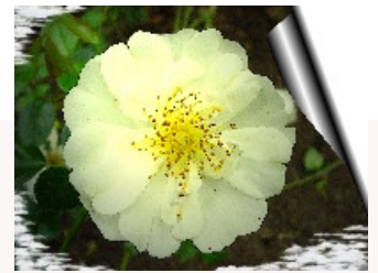
The White Rose of York

Yorkville Historical Society P.O. Box 1122 • York • SC 29745